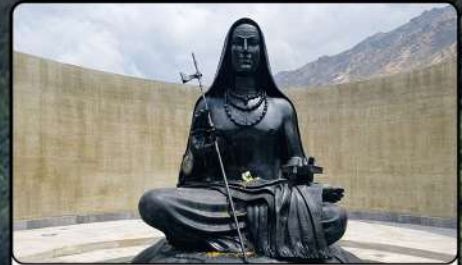
Adi Shankaracharya Samadhi