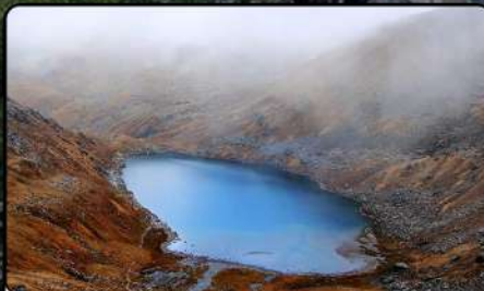
Vasuki Tal Trek

Trekking peak offering 360-degree views of the Himalayas.