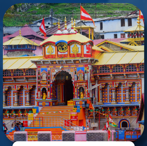
KEDAR + BADRI