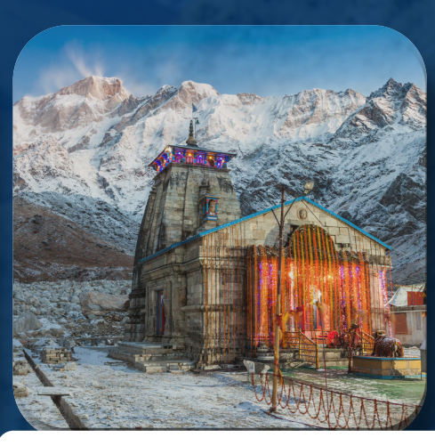
KEDAR + TUNGNATH