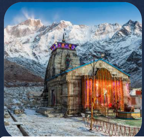
KEDAR + TUNGNATH