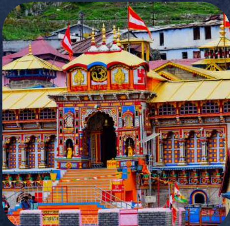
KEDAR + BADRI