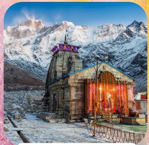
KEDAR + BADRI